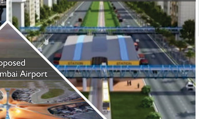
Proposed Navi Mumbai Airport