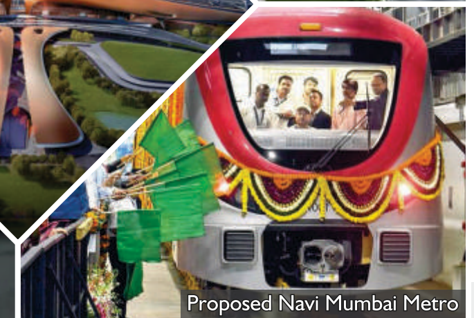
Proposed Navi Mumbai Metro