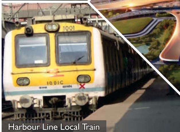
Harbour Line Local Train